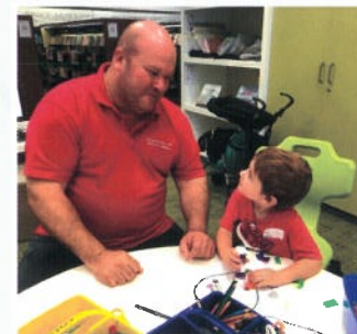
Air-conditioning and solar for all State Schools