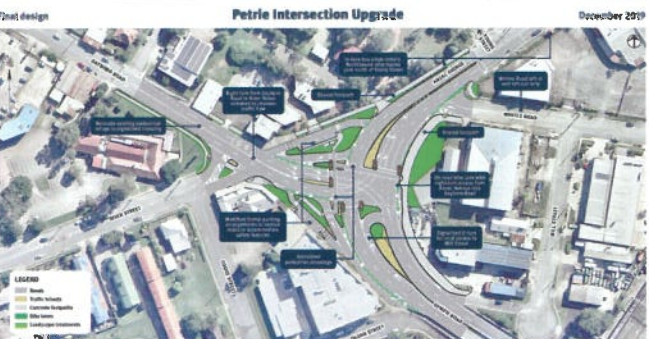
Petrie Intersection Project Design