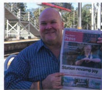
Upgrading Dakabin (above) and Lawnton (below) Stations